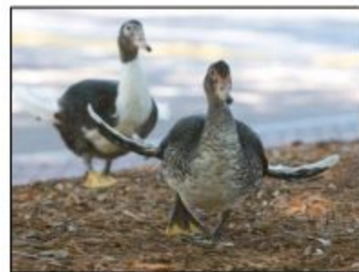
Angel Wing Image source in references.

Even though the ducks do have the appropriate food available to them within the vicinity of the pond, students still feed the ducks because it's enjoyable. If people want to feed the ducks, we should offer food